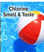
Chlorine Smell & Taste