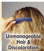
Unmanageable Hair & Discoloration