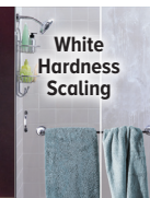
White Hardness Scaling

Start enjoying quality filtered water today!