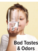
Bad Tastes & Odors