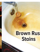
Brown Rust Stains