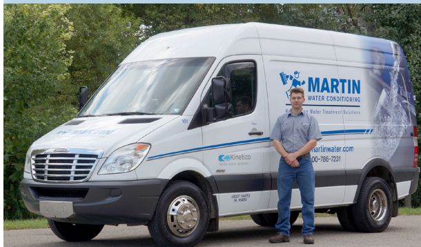
Factory Trained Technicians